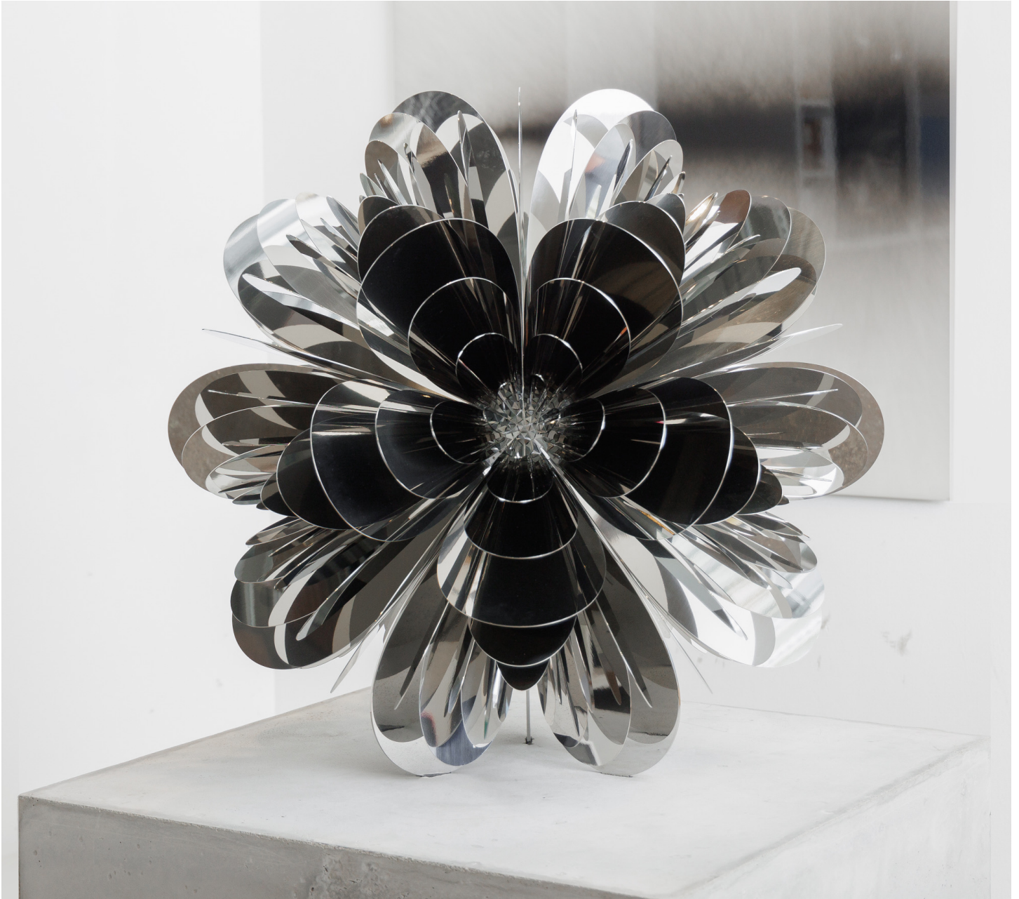
"Bloom No. 4" by Norman Mooney