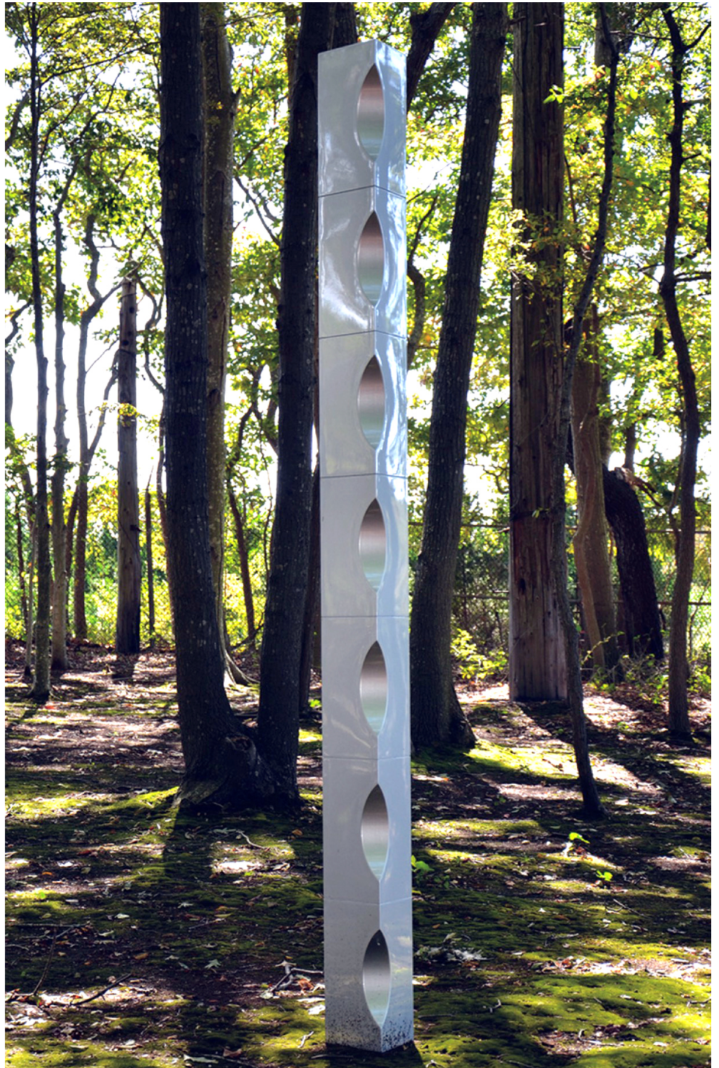
"Column with 7 Crescents" by Carol Ross