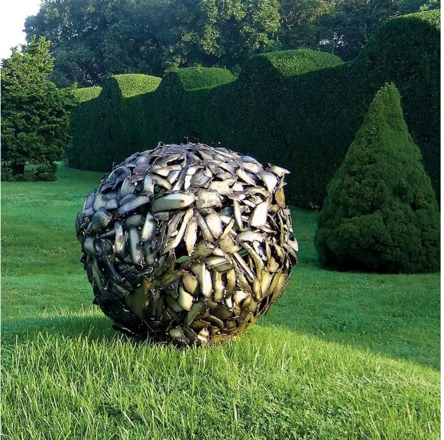
"Copernicus' Midnight Sun" by Isobel Folb Sokolow